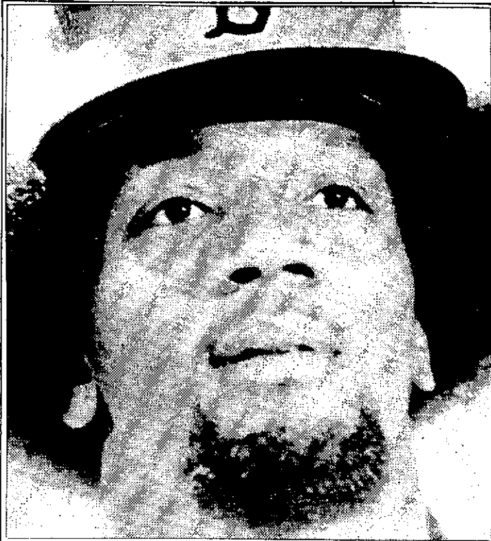
Billy Sims makes it happen on and off the field.